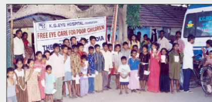
Free Eye Camp for poor children