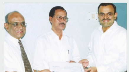
Tsunami Relief Fund of Rs. 20 lakhs given to District Collector, Coimbatore