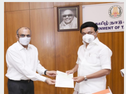
Rs. 1 Crore donated to Chief Minister Relief Fund to battle Covid-19