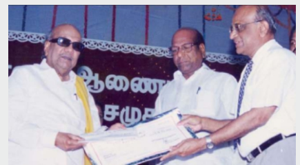
Kargil War relief fund worth Rs. 16 Lakhs