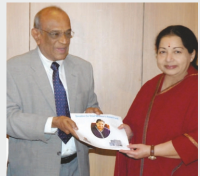
Thane Cyclone in Tamilnadu Donated Rs.15 Lakhs