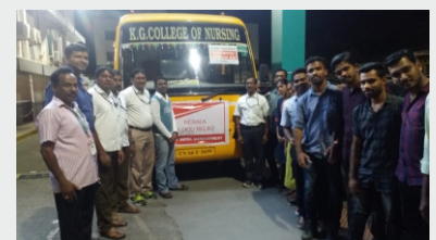
Kerala Flood Relief