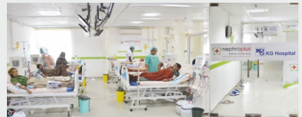
K.G. Hospital has provided dialysis to over 3,000 people free of charge.