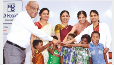
Blood given free of cost to Thalassemia Children for their lifetime

Tsunami Relief Fund of Rs. 20 lakhs given to District Collector, Coimbatore