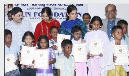
Patients who underwent free heart surgery under Sun Foundation, Heart Surgery Scheme