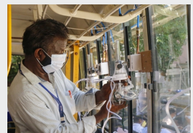
Organised 2 buses with Oxygen support and it was parked at Coimbatore Medical College Hospital