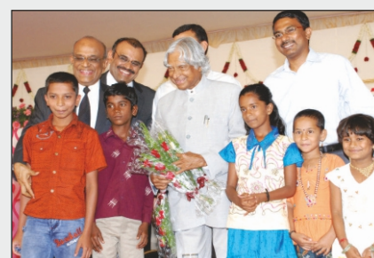
Former President Dr. A.P.J. Abdul Kalam with children who underwent free Heart surgeries